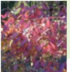
Northern wild raisin Viburnum cassinoides

Features striking yellow flowers that bloom in the summer. Tolerates a wide variety of growing conditions and attracts many native pollinators.