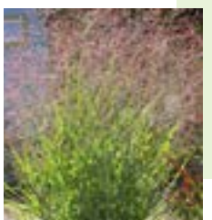
Switchgrass Panicum virgatum

Eye-catching, bright yellow flowers bloom in the summer. Requires minimal care once established.