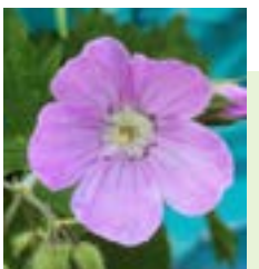
Wild geranium Geranium maculatum

Offers seasonal interest year round. Vibrant summer berries. Fall colours range from orange to purple.