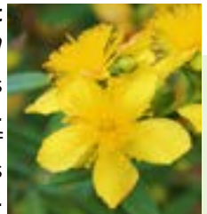
St. John's wort Hypericum kalmianum

Also known as Chinese silver grass, eulalia, zebra grass.