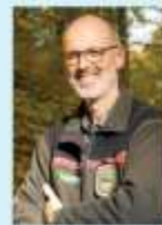
Peter Wohlleben In 2016 Greystone Books

Book sales by University of Toronto Bookstore