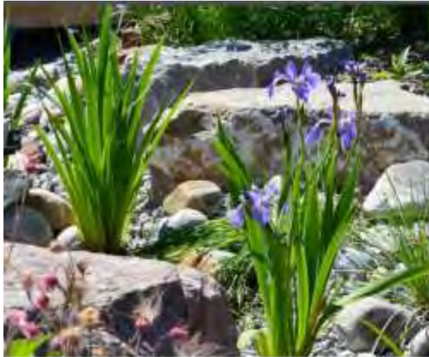
A Green Infrastructure Guide for Small Cities, Towns and Rural Communities