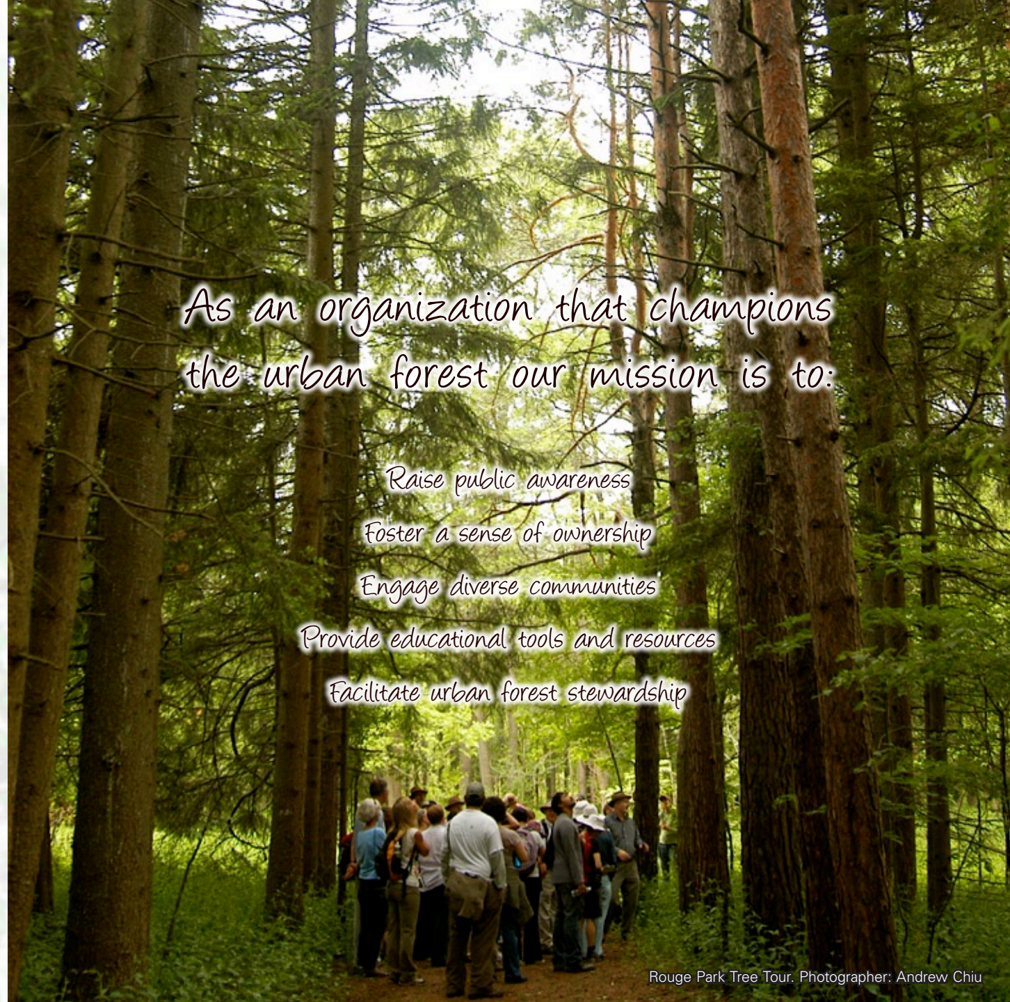
Rouge Park Tree Tour. Photographer: Andrew Chiu